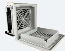
2. Remove Filter