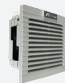
4. Close Grille