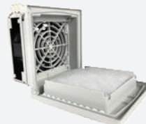
3. Insert Filter