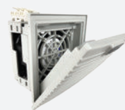
1. Open Grille