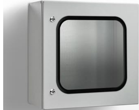
Image shown is for reference only. See table below for the accurate sizes and specifications.

Surface Treatment: UL approved AkzoNobel epoxy polyester powder coated with a textured finish. 80-120 micron average thickness. Colour RAL7035 Light Grey (standard electrical enclosure).